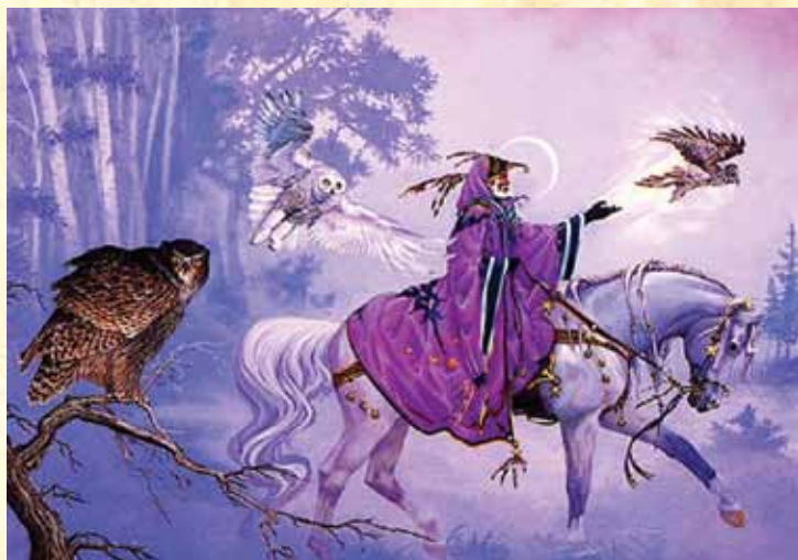
Art © Janny Wurts