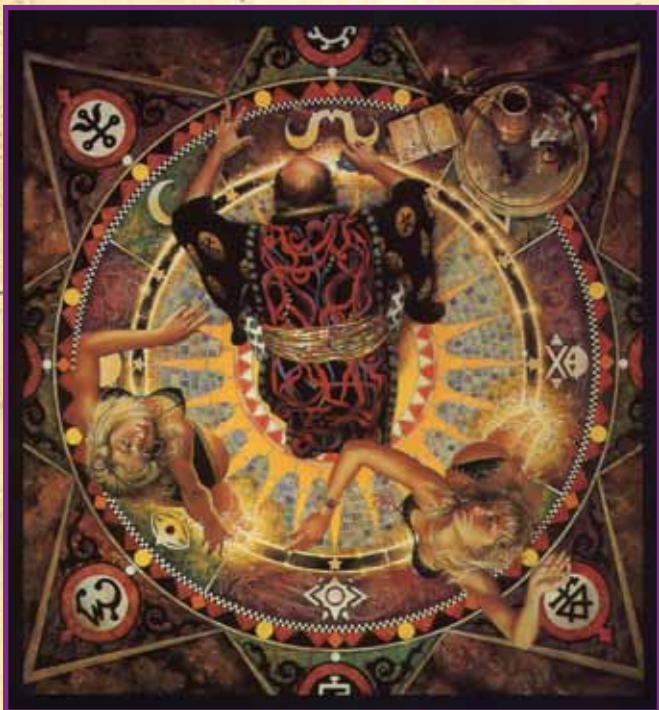
Art © Don Maitz